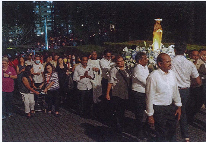
Some 500 parishioners of St Mary's participating in an outdoor rosary procession on the evening of Aug 2. Our Lady's statue was carried by members of the parish's Tamil community.

"The porziuncola was a place dedicated to the Virgin Mother of God, and it was abandoned," he said. "St Francis [of Assisi] had a great devotion to Our Lady, and when he saw that the place was in ruin and heard the call from God to 'repair my church', he stayed