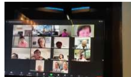
Waiting for Seniors to login to the Thanksgiving Zoom session from their homes.

Thanks to Tan Kim Suan for putting in a lot of time and effort to organise a Thanksgiving Zoom Session for all Seniors who were free to meet up from 3.00 pm to 5.00 pm