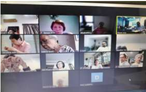
Getting ready to pray the Rosary.

Your sharing was better food than the food we could have if we meet on site. The bonding fostered through the sharing was better achieved than any games I could think of if we had the celebration at Gubbio today. Indeed we have one thousand reasons to thank Him.