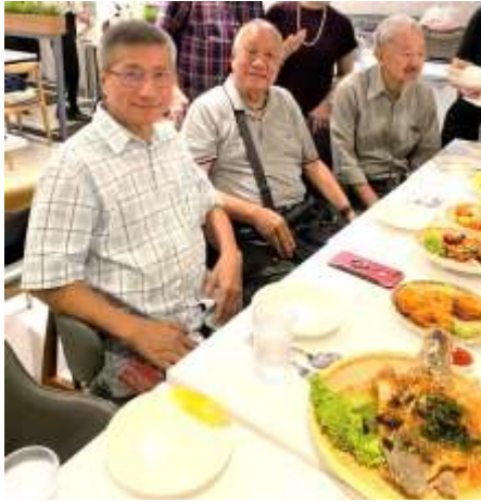
A picture before tucking in to the food.

It was heartening to see everyone leaving the restaurant happy and contented. It was indeed a wonderful catch-up!