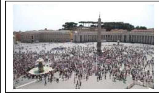
The crowd watches as Pope Francis leads the Angelus message from the window of his studio overlooking St Peter's Square at the Vatican August 1.

Vatican City ---- People should seek Jesus out of genuine love, not calculated self-interest, Pope Francis said.