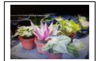
Part of the 800 pot of plants prepared for the parishioners to take home.

Together with this booklet, parishioners can pick up a small pot of plants (as a parallel) to help them focus and nurture their relationship with the Cross. They can bring back the pot of plants to Church to create the Easter Garden just as Christ was laid in a tomb in a garden and then was resurrected in that garden.