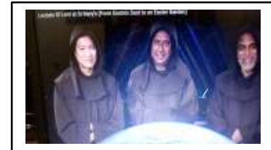
The 3 Franciscan Friars of the video.

What a catchy theme with a cool video by our Franciscan Friars to appeal to us to save Mother Earth and make amends for our sins against God’s creation.