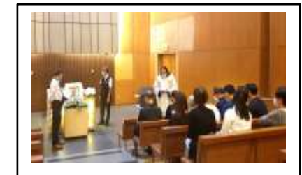
At Mandai Crematorium.