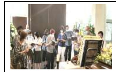
Prayer at the wake.