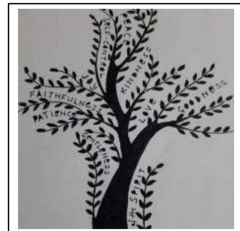
Depicting the fruits of the Spirit with a black marker.