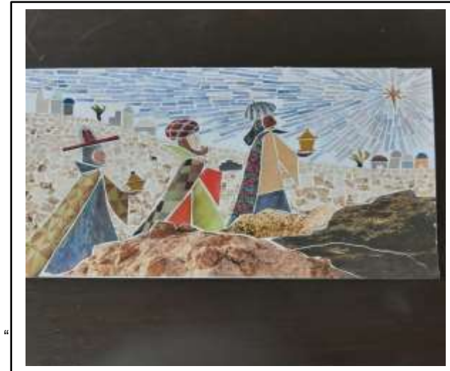
Creating a picture of the visit of the Three Wise Men using magazine paper.

Is it good to think about death? Death may seem like an uncomfortable subject to think about regularly, but it has proven to do wonders for the human experience. It is true ... thinking about death regularly forces us to do just that and results in us living healthy lives.