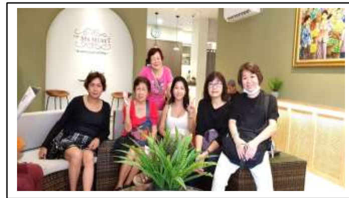
At Secret Spa Waiting for a good massage.

It was truly a wonderful trip for everyone simply because everyone was so wonderfully accommodating and easy going. We were all like millionaires indulging in yummy but cheap seafood, berserk shopping and of course two hours of relaxing massage.